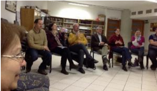
Couples who attended the meeting