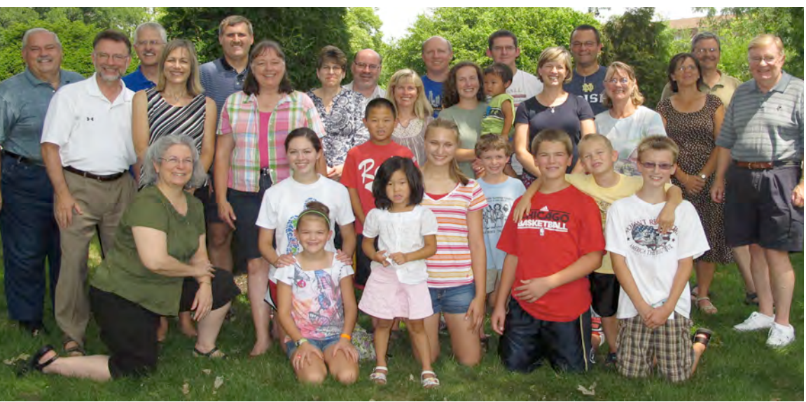
USA Board members and their families gather for a group photograph at the 2011 Summer Board Meeting at the Cabrini Center, Chicago.

Canada United States CFM USA MFCC MFC LA