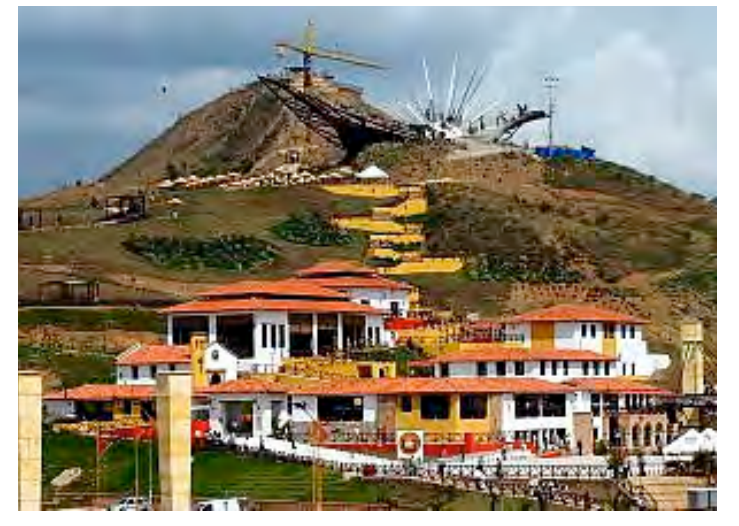
A view of the Parque Nacional del Chicamocha

tourism and adventure sports. A cable car provides a dramatic crossing of Chicamocha Canyon.