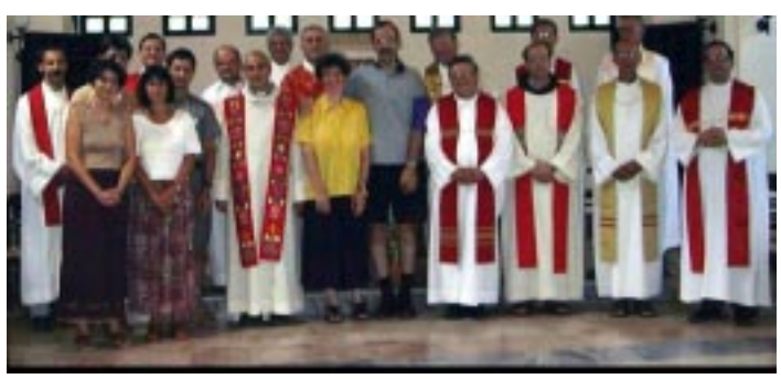
Priest Encounter in Hungary