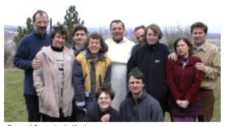
Engaged Encounter in Ukraine