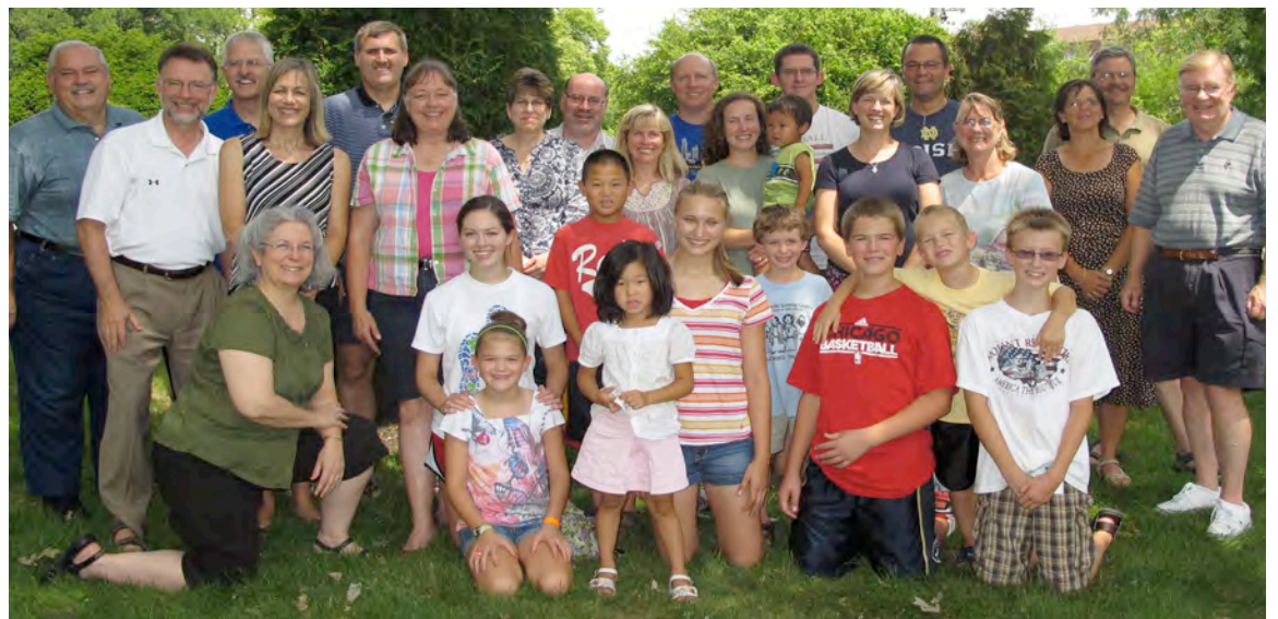
USA Board members and their families gather for a group photograph at the 2011 Summer Board Meeting at the Cabrini Center, Chicago.

Canada United States CFM USA MFCC MFC LA