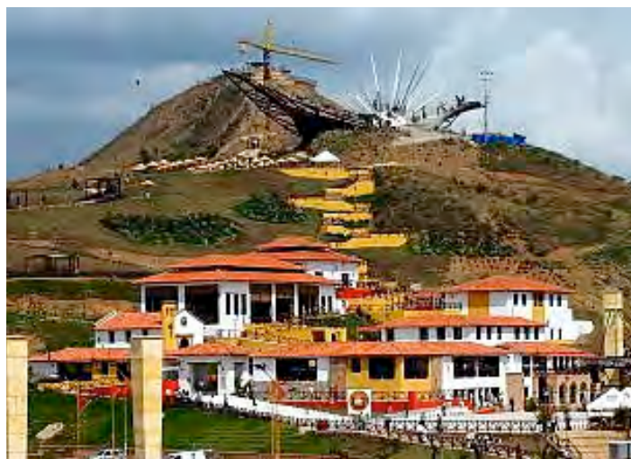
A view of the Parque Nacional del Chicamocha

The Parque Nacional del Chicamocha features colonial buildings, cultural opportunities and history, as well as eco-