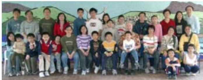
Family Movement in Hong Kong

We received a warm reception in Seoul. The representatives of CFM Korea