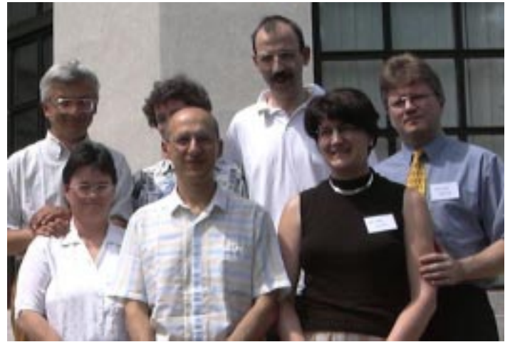
Marriage Encounter in Hungary