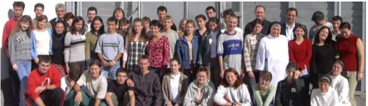
Sons and Daughters Encounter in Ukraine