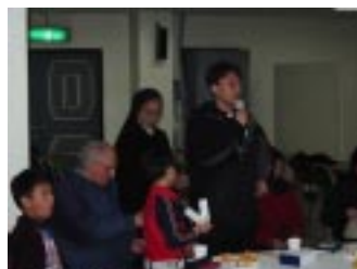
Family Movement in Korea