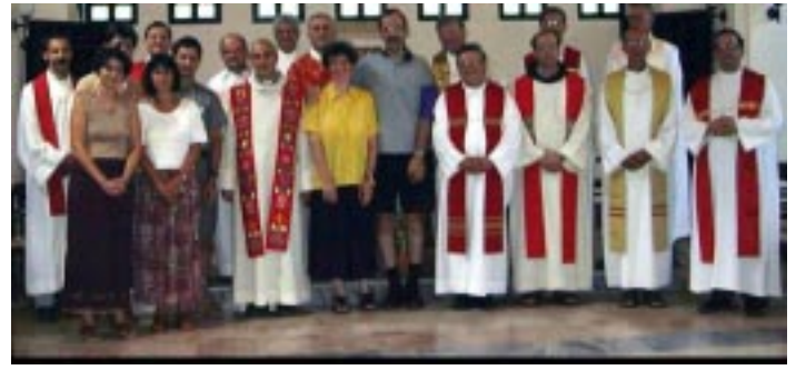
Priest Encounter in Hungary