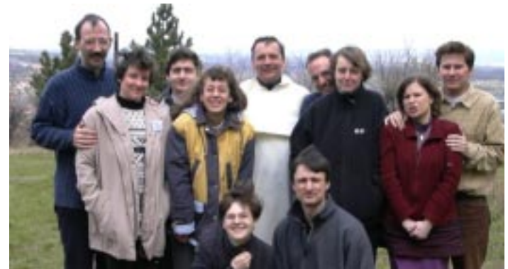
Engaged Encounter in Ukraine