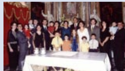
The Gauci clan.