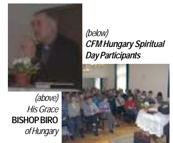
(below) CFM Hungary Spiritual Day Participants

After a long period of hard work, we presented five printed booklets for CFM group meetings. Each booklet contains full material for ten group meetings: starting