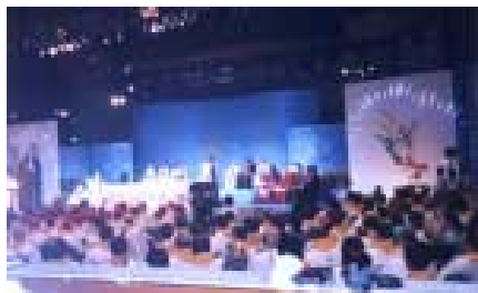
Address by His Eminence Cardinal Sin