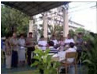
OATH TAKING OF CFM ARCHDIOCESAN

Greetings from Cebu! We have calendared every third Sunday as our meeting at the archdiocesan level. Two weeks after installation day, we scheduled the first meeting under our leadership. We were very happy to see old familiar faces we hadn't seen for quite a time—a very encouraging start! We hope the Holy Spirit will continue to inspire them to come faithfully to these meetings.